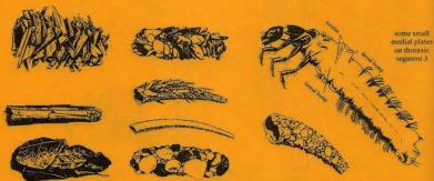
Northern Case Makers Family Limnephilidae Scraper (if case mineral) Shredder (if case organic) up to 1 1/4"