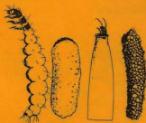
Micro Caddisflies Family Hydroptilidae Scraper up to 1/4"