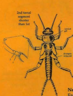
Nemourid Broadbacks Family Nemouridae Shredder up to 1/2" *