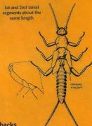
Taeniopterygid Broadbacks Family Taeniopterygidae Shredder up to 1/2" *